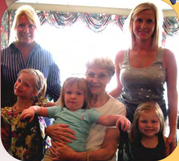
Four generations of Virginia's family