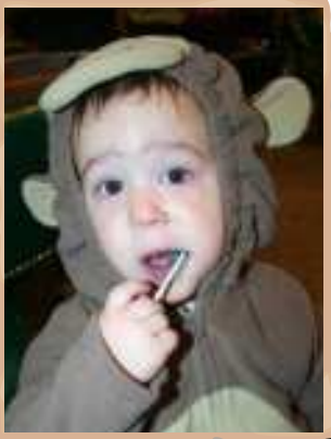
Jo Marsh is an artist!