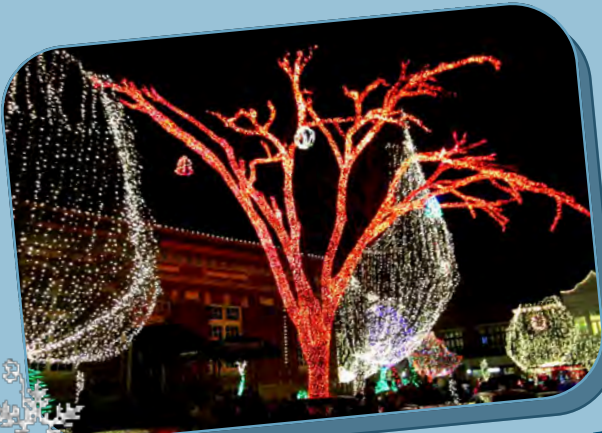
Our favorite tree at the Lights of the Ozarks display at the Fayetteville Square