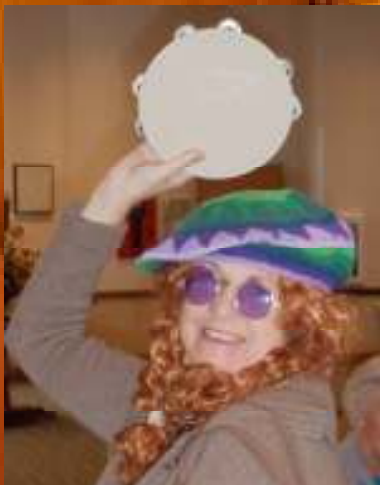
Who says a Community Director can't be "cool"???