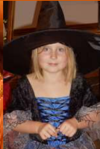
Dietary Aid Abe's lil' Granddaughter.