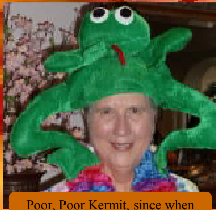
Poor, Poor Kermit, since when do they wear frogs on their heads?