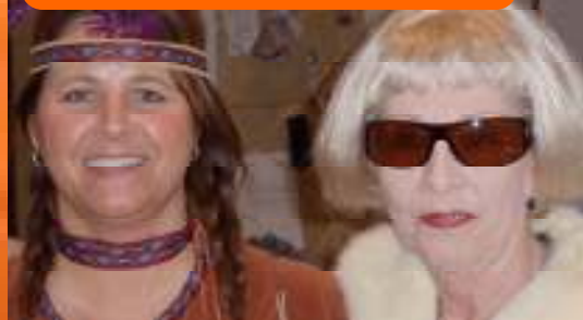
Pocahontas the medicine woman & the mysterious receptionist.