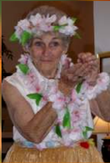
Happy Plunkers tribute to The Islands.