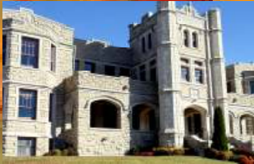
Residents enjoyed a tour at Pythian Castle.