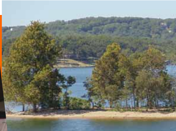
View of Table Rock Lake from the Branson Belle.