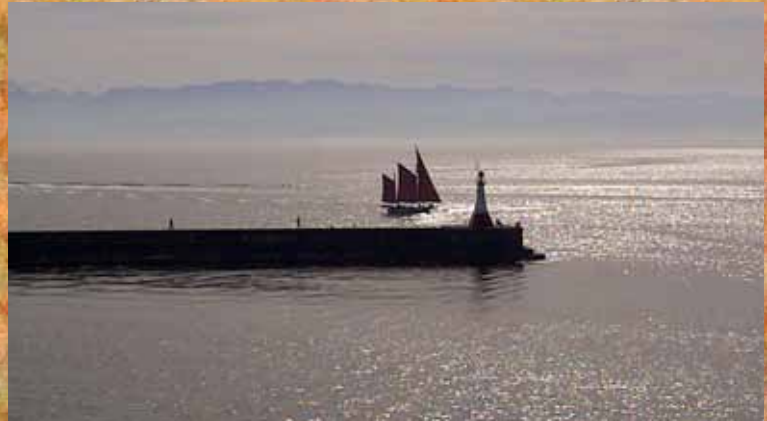
A view of the sea off of our balcony at Victoria. Lovely and placid...