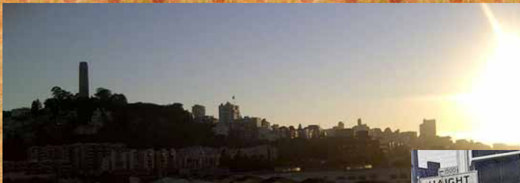
San Francisco in the late afternoon.