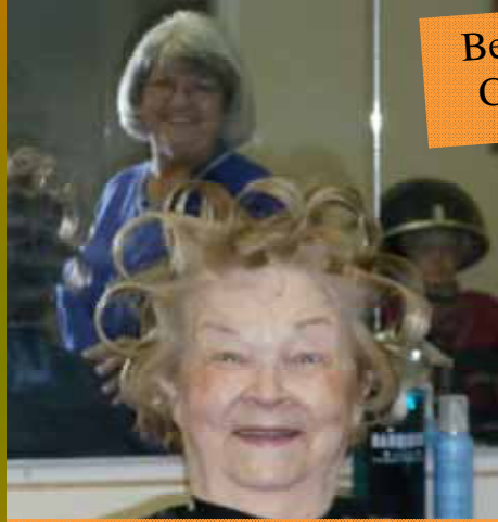
Imogene Who preparing for the WHOVILLE BALL!