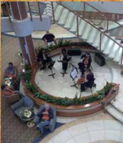
There's always entertainment on a cruise ship...