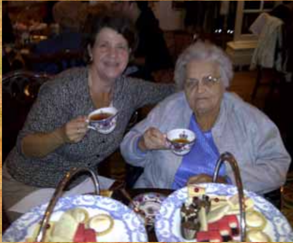
Mom and I enjoyed High Tea at the Empress Hotel in Victoria, BC, Canada. They have been serving tea for over 100 years there, and it is quite the thing to do!!